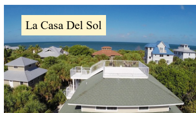
La Casa Del Sol