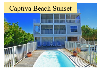
Captiva Beach Sunset